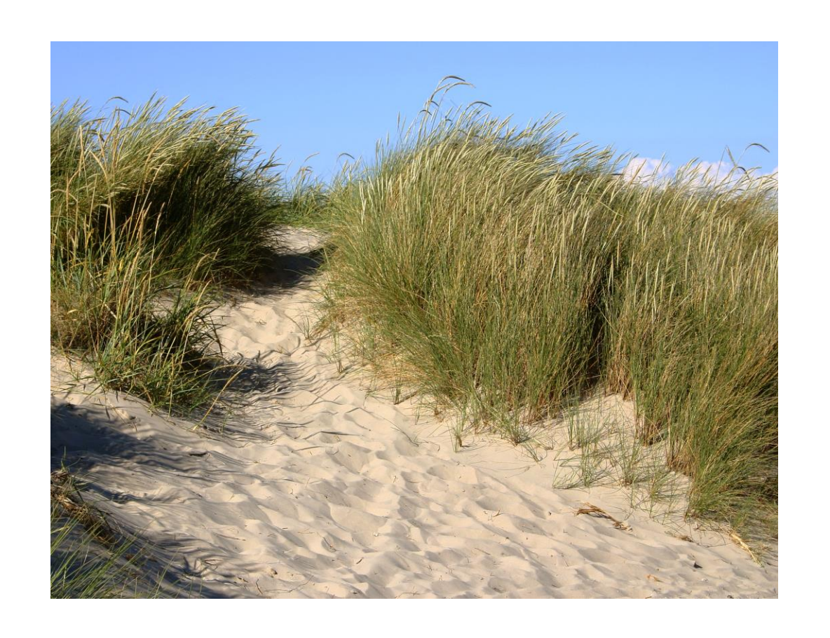
Another Invasive: European Beach Grass (Ammophila arenaria)

See if you can match the picture to the name and indicate if it's a nonnative invasive plant or "just a weed."